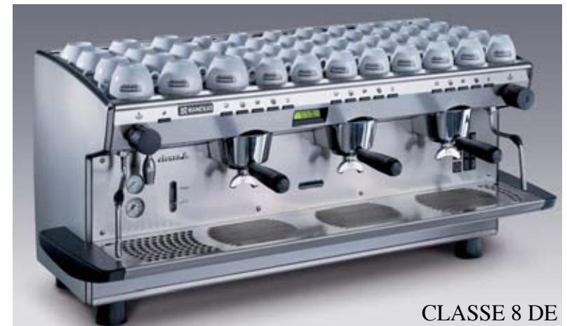
CLASSE 8 DE